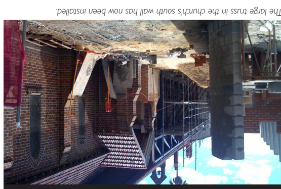
The large truss in the church's south wall has now been installed.